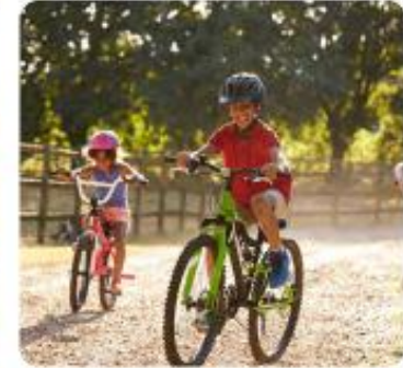
Paseamos en bici. We go bike riding.