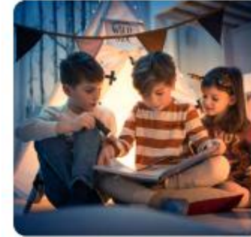
Leemos libros. We read books.

Red / Orange / Green Red / Orange / Green Red / Orange / Green Red / Orange / Green Red / Orange / Green Red / Orange / Green